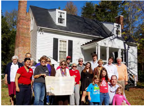
Members gather at the October 2011 meeting at Locust Grove